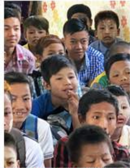
Sanda Rama Monastic School Students Will Take Their Places as Future Leaders of Myanmar.